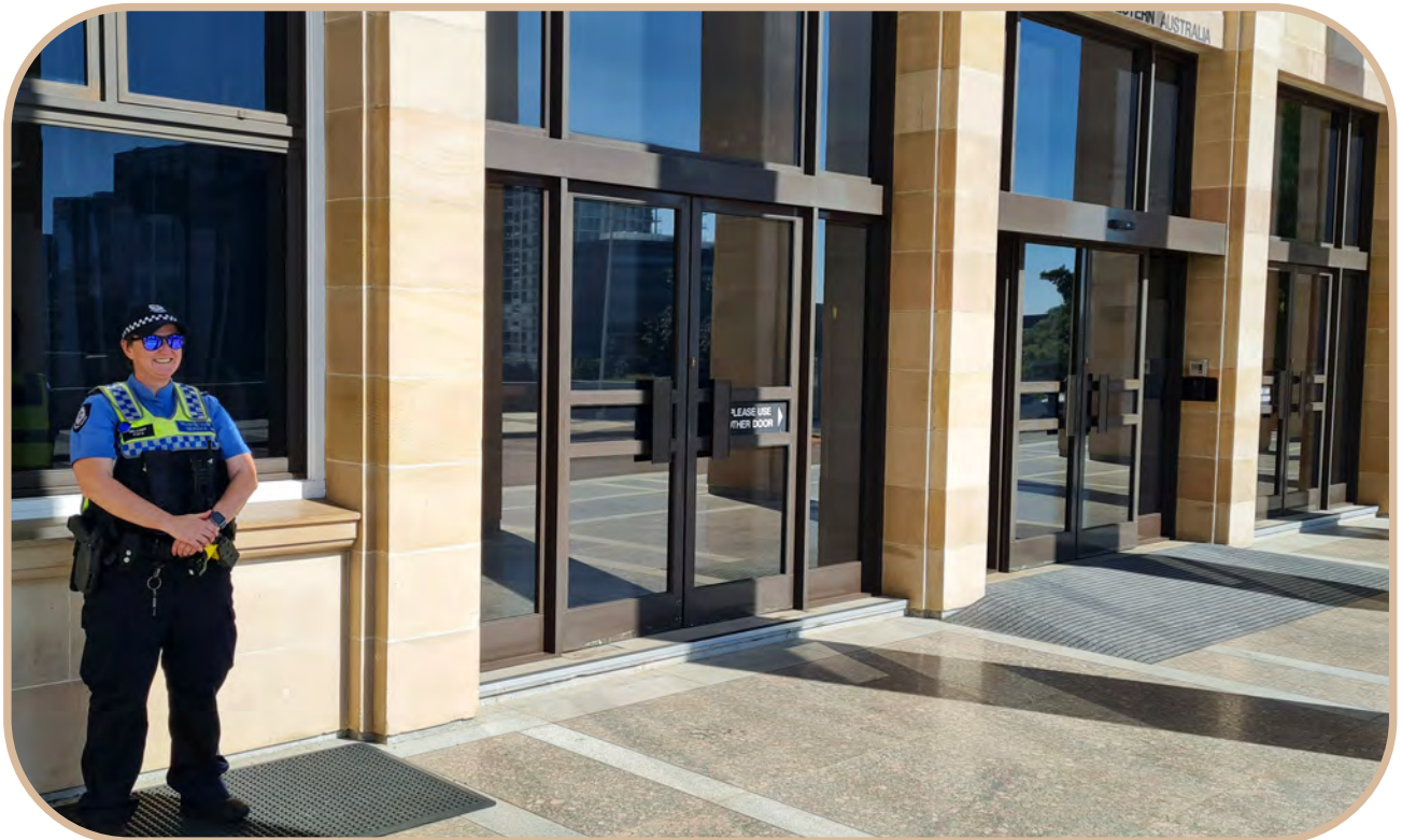
Friendly Officers keep everyone safe