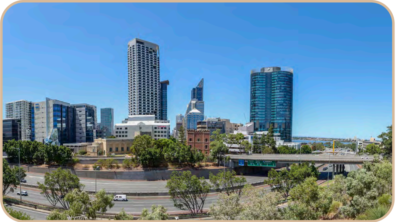
The view from the front of Parliament House